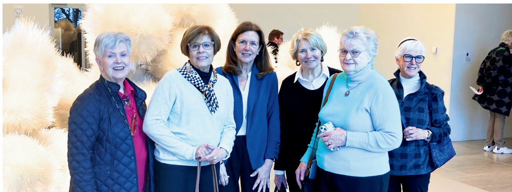
On the Road: The Bruce Museum