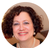
Barbara Galazzo Garden Mosaics