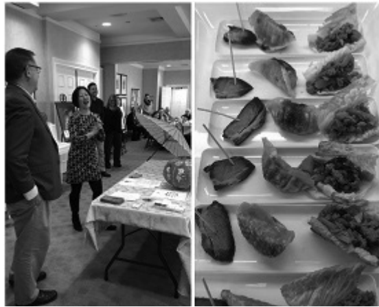
Members enjoyed a Chinese themed menu and entertainment to celebrate the Year of the Pig. Special thanks to Firstlight Home Care for sponsoring and moderating the event.