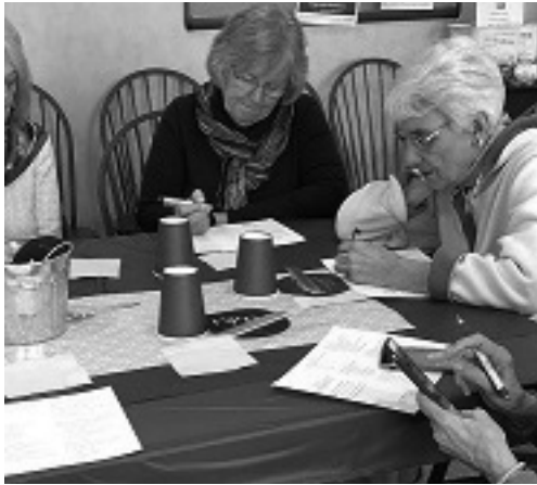
A Family Feud style game show tea sponsored by RVNA, had members racking their brains for fun facts from the past.