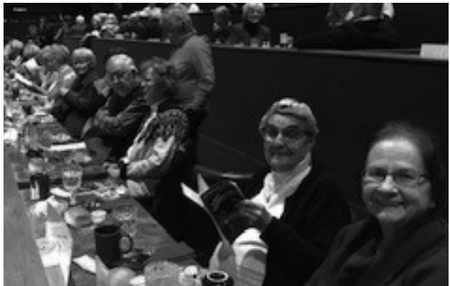
Members spent an afternoon at the theater to see Westchester Broadway's Theater's Ain't Misbehavin' , a musical revue.